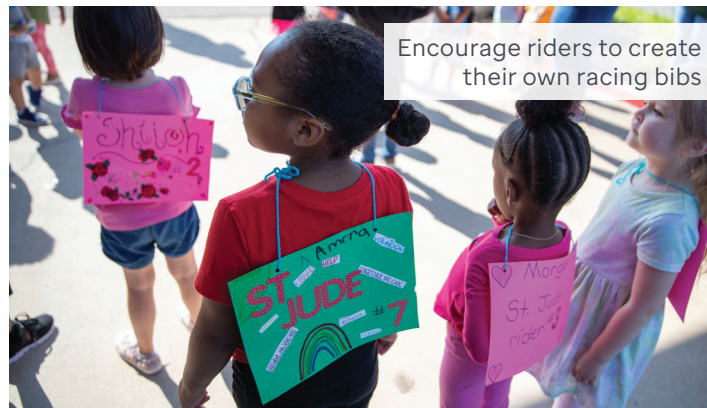
Encourage riders to create their own racing bibs