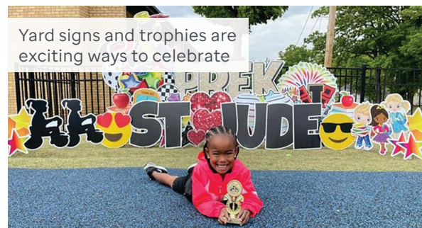
Yard signs and trophies are exciting ways to celebrate