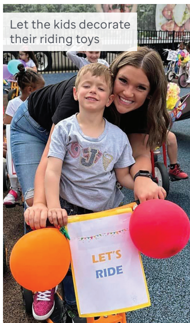
Let the kids decorate their riding toys