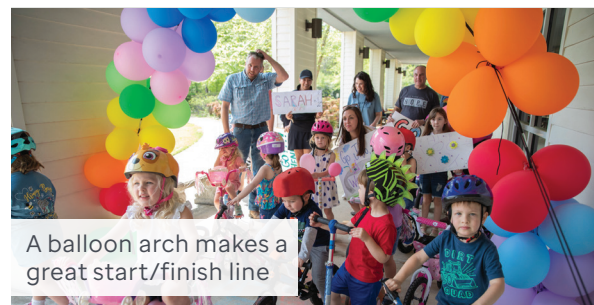
A balloon arch makes a great start/finish line