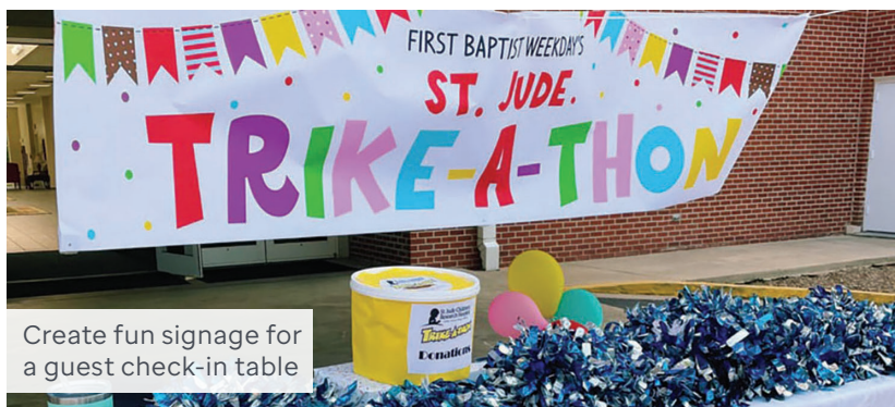
Create fun signage for a guest check-in table