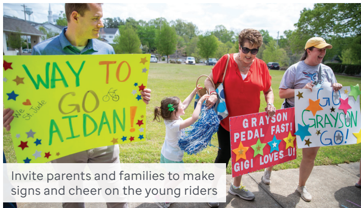
Invite parents and families to make signs and cheer on the young riders

Be inspired to take your St. Jude Trike-A-Thon to the next level. Try some of these fun ideas to further excite your participants at your event.