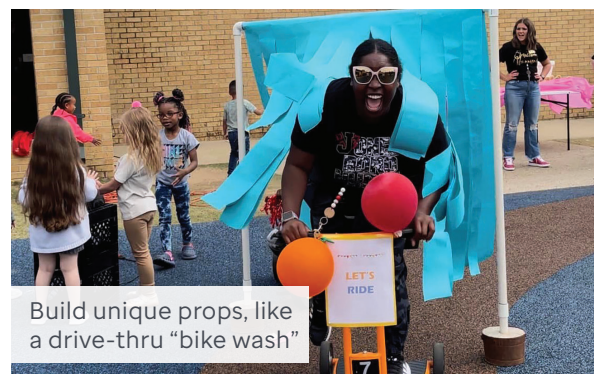
Build unique props, like a drive-thru "bike wash"